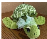
Deaf-bits Seventie, Class of '70' Mascot